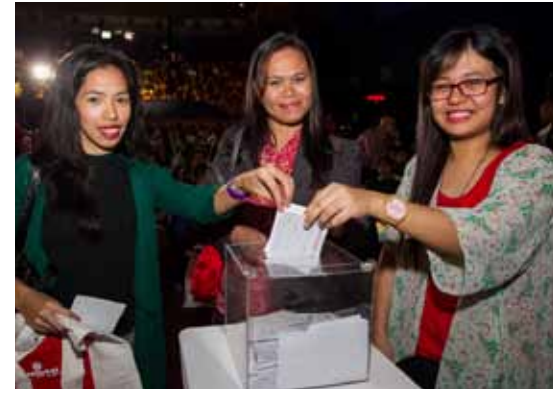
Participants dropping off their raffle stubs for a chance to win awesome prizes