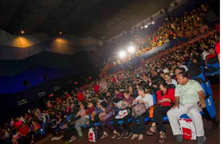
Record-breaking attendance with almost 800 passengers and Philam Life Financial Advisors