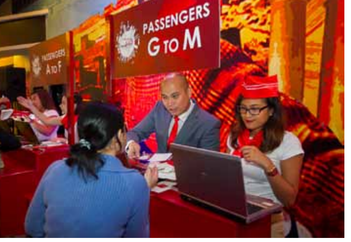
Early-morning passengers checking in for their flight bound for