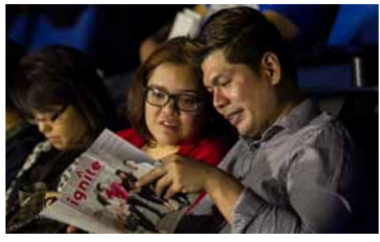
Guests reading the success stories of some of Philam Life's Next Generation Financial Advisors who have achieved their life dreams and are living their real passions