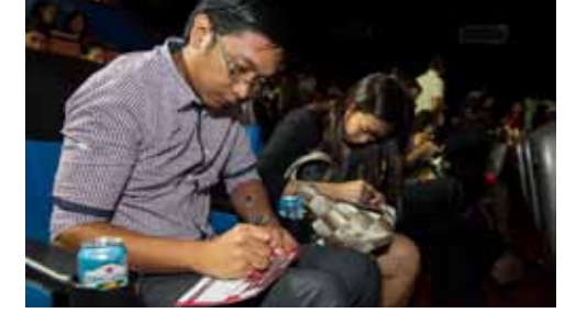
Guests taking the bold step and signing up for Philam Life's training and development programs institutionalized by the Premier Academy