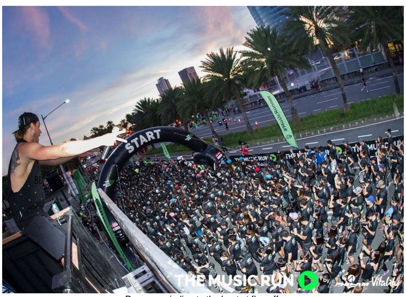
Runners grinding to the beat at flag off.

16F – 18F Philam Life Head Office Net Lima Building, 5th Avenue cor. 26th Street Bonifacio Global City, Taguig 1643, Philippines T: (632) 521 6300 / (632) 526 9200 E:philamlife@aia.com W: philamlife.com Customer Hotline: (632) 528 2000